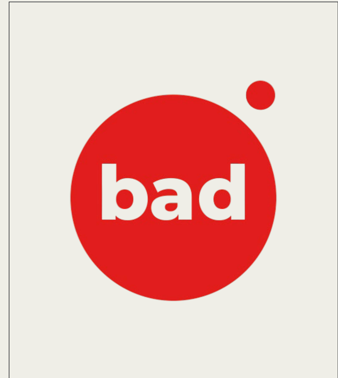
Logo of the Portuguese Association of Librarians, Archivists, Information and Documentation Professionals